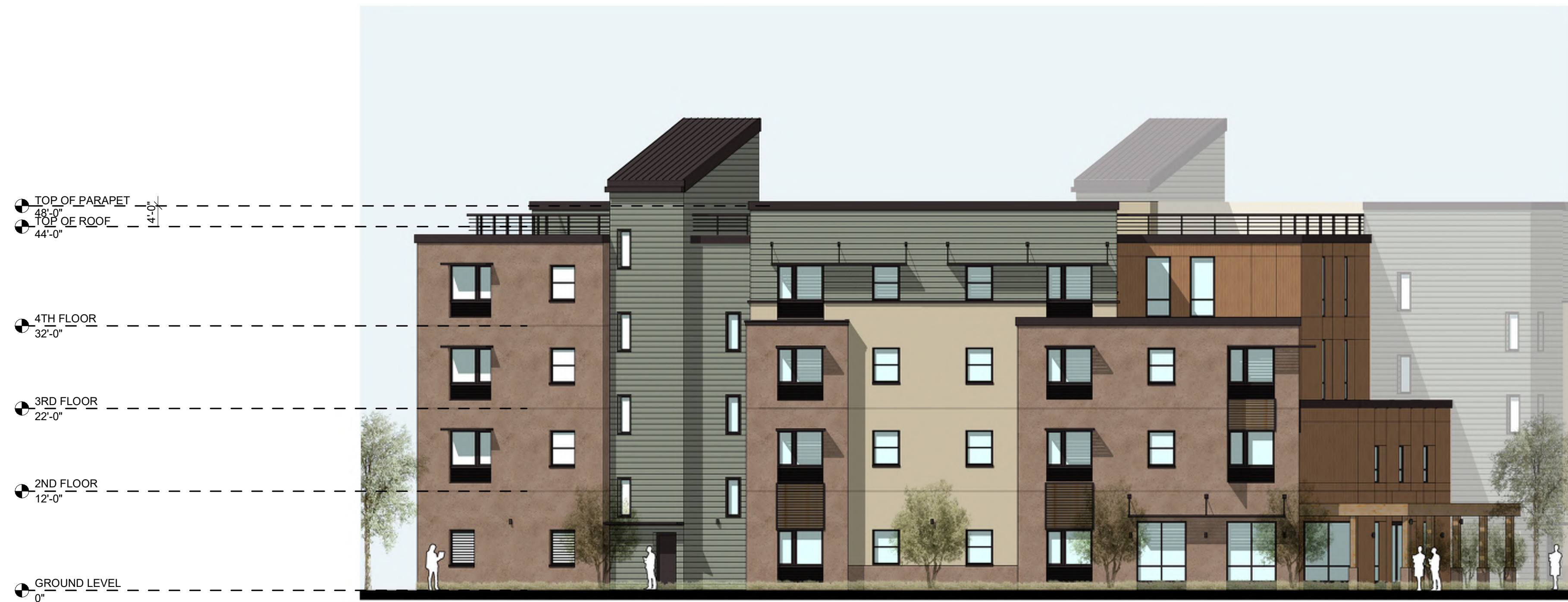
2 EAST ELEVATION A7.6 SCALE: 1" = 10'-0"