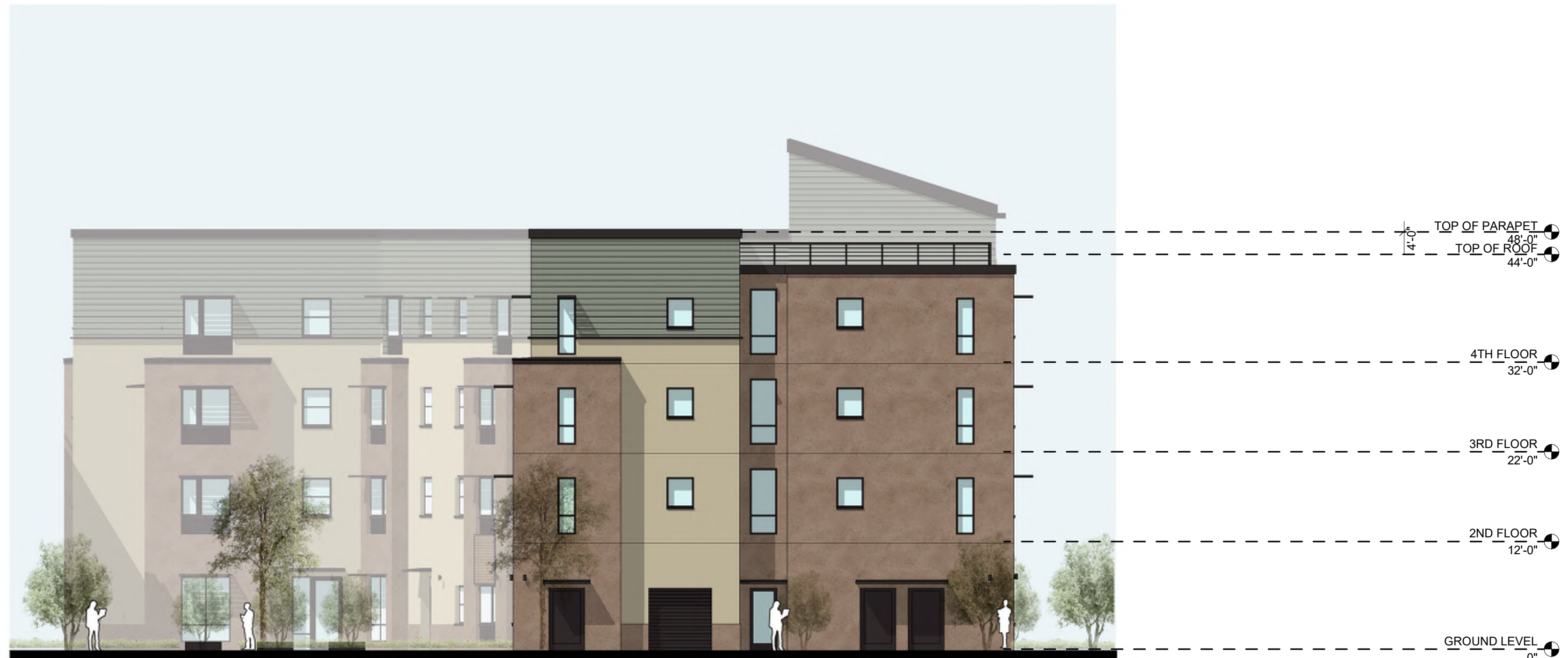
1 SOUTH ELEVATION A7.6 SCALE: 1" = 10'-0"