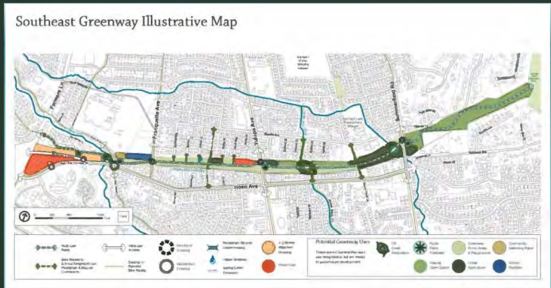
Southeast Greenway Illustrative Map