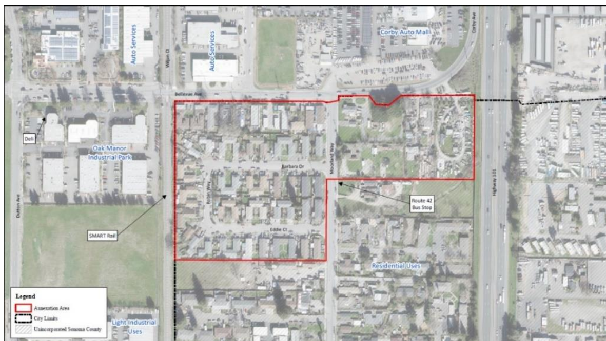
Figure 1 – Prezoning Boundary

Before beginning construction, two important administrative tasks must be completed. First, the project area must be Prezoned by the City, followed by annexation through the Sonoma Local Agency Formation Commission (LAFCO). The project is being funded by the Water Board's Division of Financial Assistance (DFA) and directed by the State of California Water Resources Control Board (Water Board), Division of Drinking Water (DDW). The City is serving as the applicant for the Prezoning application, as it will provide water and associated infrastructure.