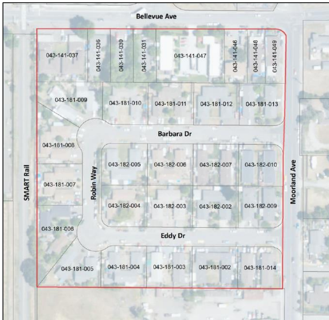
Figure 2 – 29 Parcels to be Provided City Water

The State and City have been collaborating to consolidate the various water systems in the area into the City water system. This process entails installing water mains in the looped street (Barbara Drive, Eddy Drive, and Robin Way) and parcels on Bellevue Avenue (See Figure 3). According to the City's GIS address information, there are 119 units on the consolidation parcels with a total area of approximately 10.19 acres. The five additional parcels proposed for annexation contain approximately nine units, totaling 4.66 acres. All of the parcels in the project area are being served by the South Park Sanitation District for sewer services. The storm drain service is currently provided by the County to this area.