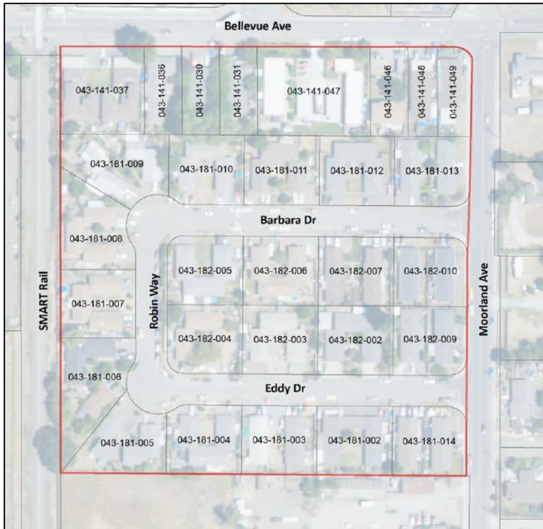
Figure 2 – 29 Parcels to be Provided City Water

The State and City have been collaborating to consolidate the various water systems in the area into the City water system. This process entails installing water mains in the looped street (Barbara Drive, Eddy Drive, and Robin Way) and parcels on Bellevue Avenue (See Figure 3). According to the City's GIS address information, there are 119 units on the consolidation parcels with a total area of approximately 10.19 acres. The five additional parcels proposed for annexation contain approximately nine units, totaling 4.66 acres. All of the parcels in the project area are being served by the South Park Sanitation District for sewer services. The storm drain service is currently provided by the County to this area.