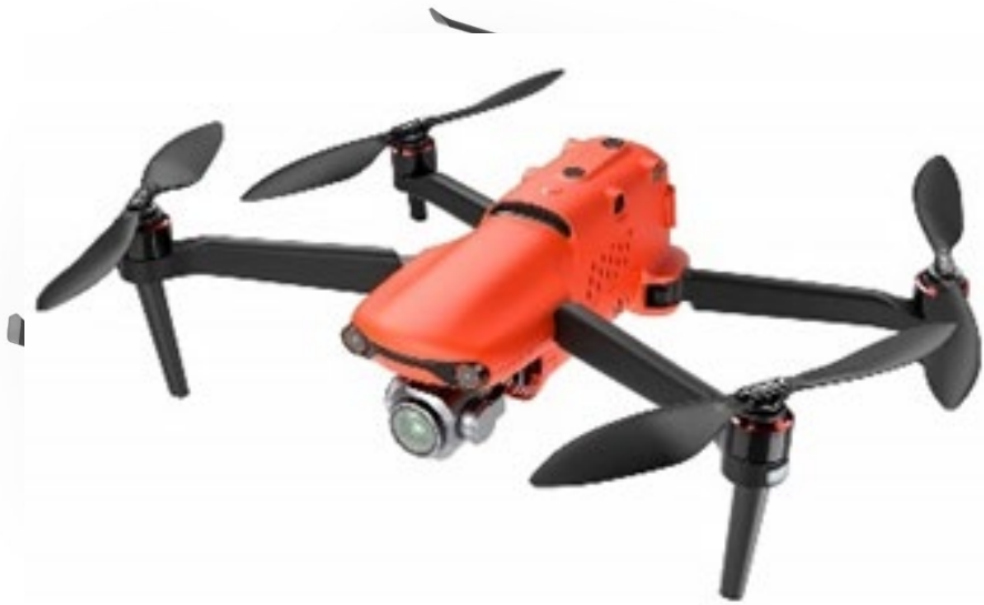
Robotex Avatar 2