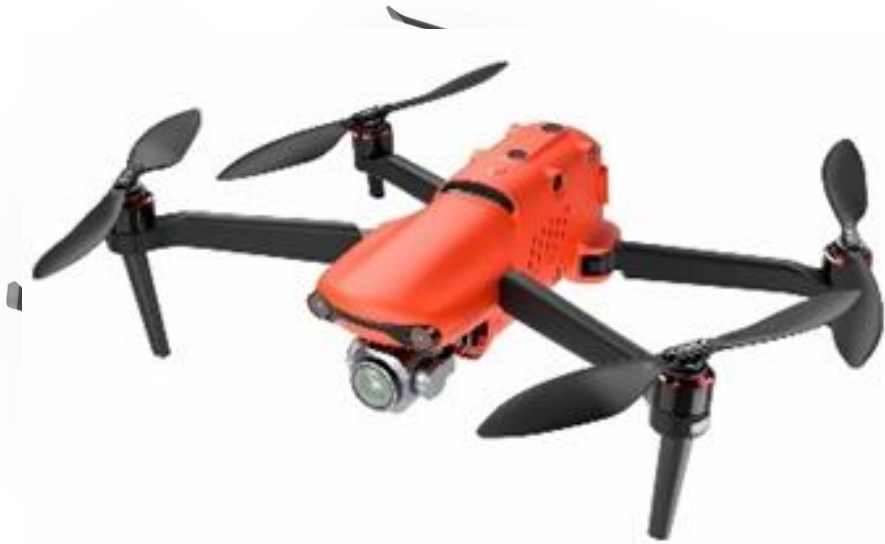
Autel EVO II