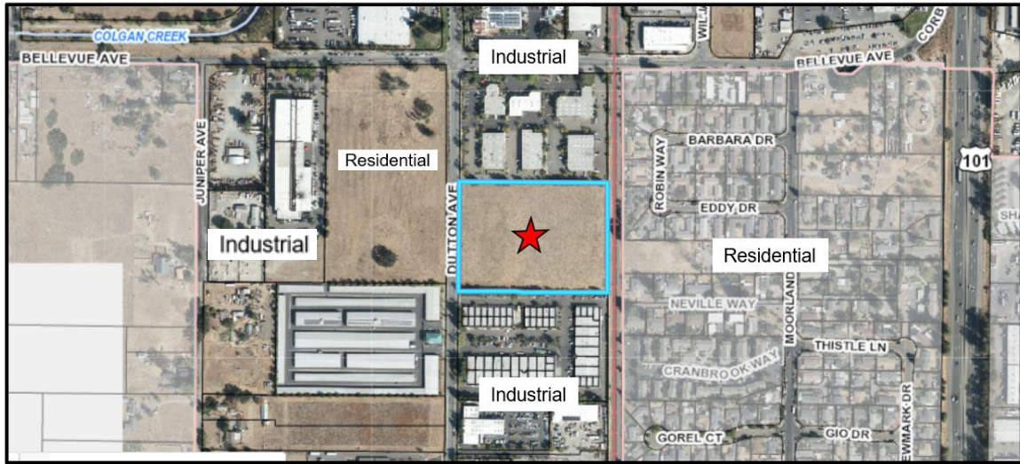
Figure 1: Surrounding Industrial and Residential Land Uses

The project site is located on the east side of Dutton Avenue, approximately 440 feet south of the intersection with Bellevue Avenue. It is surrounded by commercial and industrial uses to the north, south, and west; fully developed residential uses to the east, separated from the site by the Sonoma-Marín Area Rail Transit (SMART) tracks; and an undeveloped parcel to the west designated for residential and commercial uses.