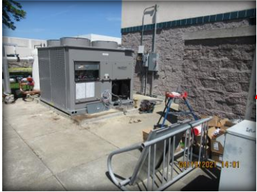
(1) 60-ton Chiller