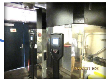
(2) Boilers & PLC