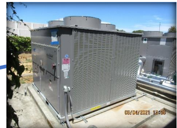
(2) 50-ton Chillers