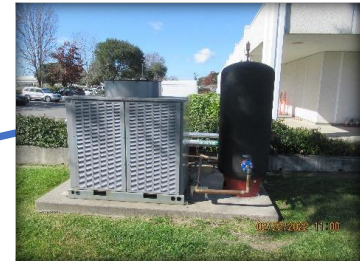
(1) 15-ton Chiller