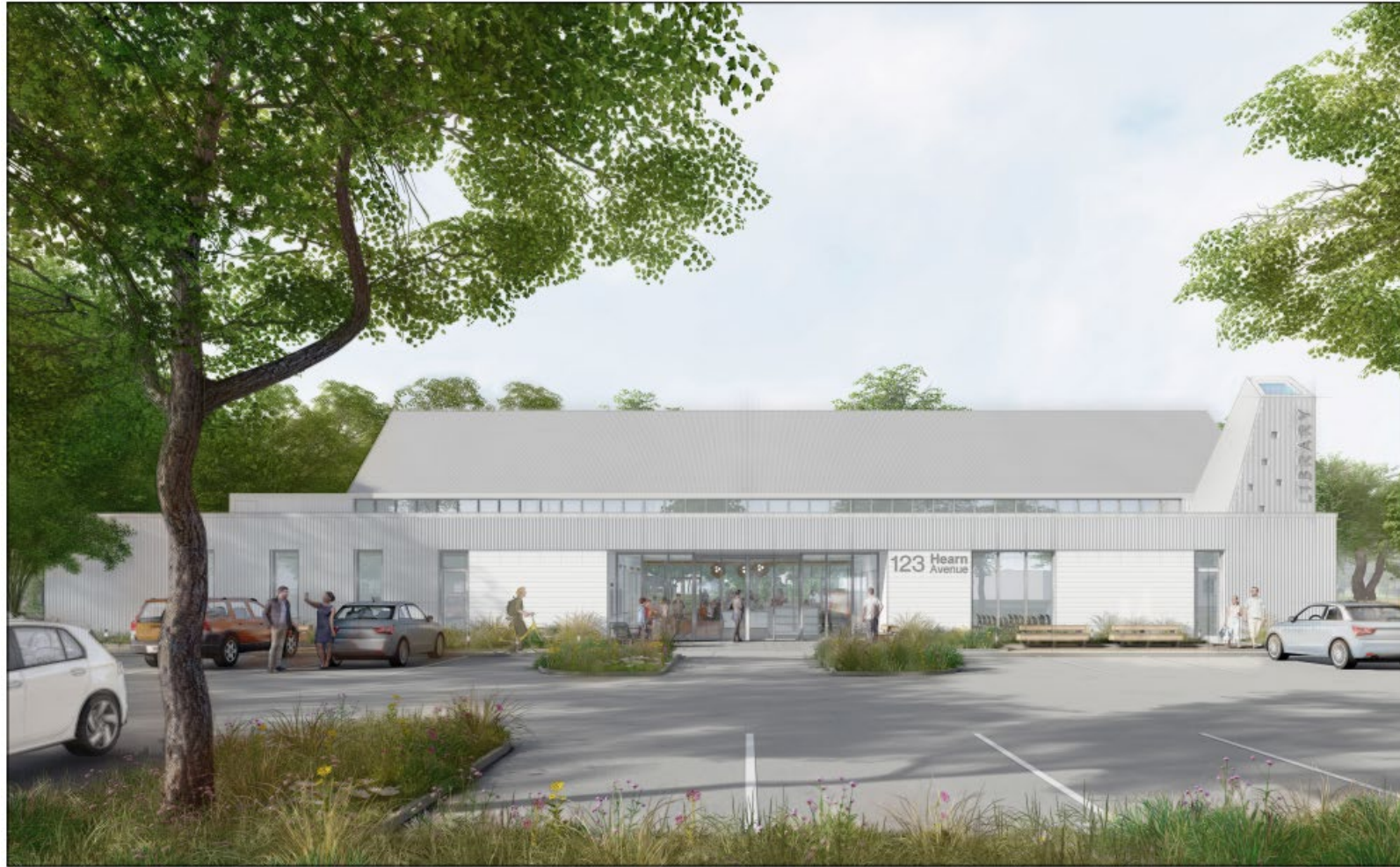
LIBRARY FROM NORTH