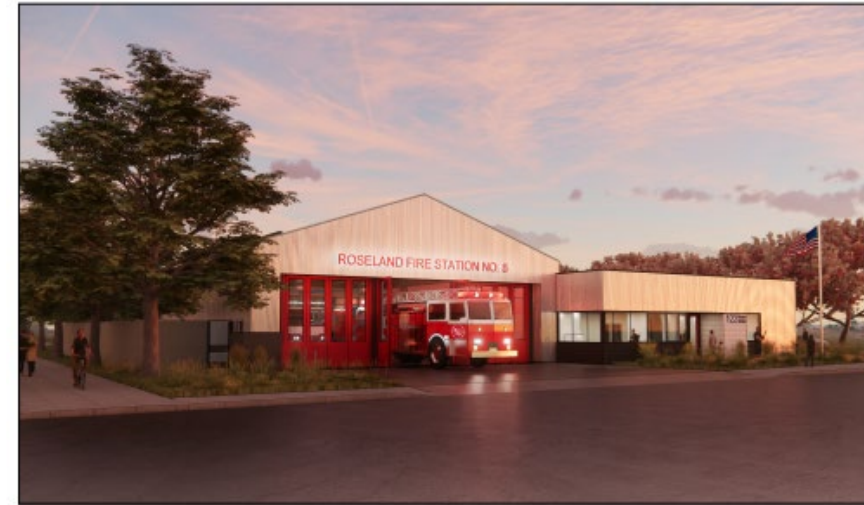
FIRE STATION AT NIGHT