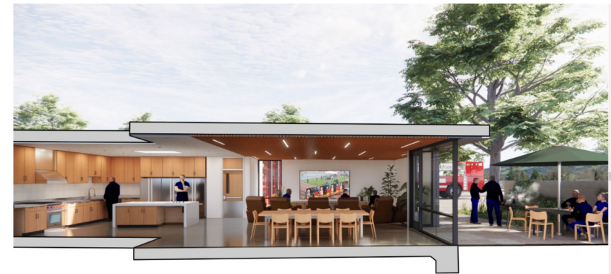
CROSS SECTION OF KITCHEN / DINING / DAYROOM / PATIO