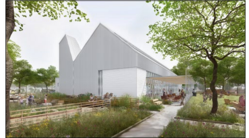
LIBRARY FROM SOUTHWEST