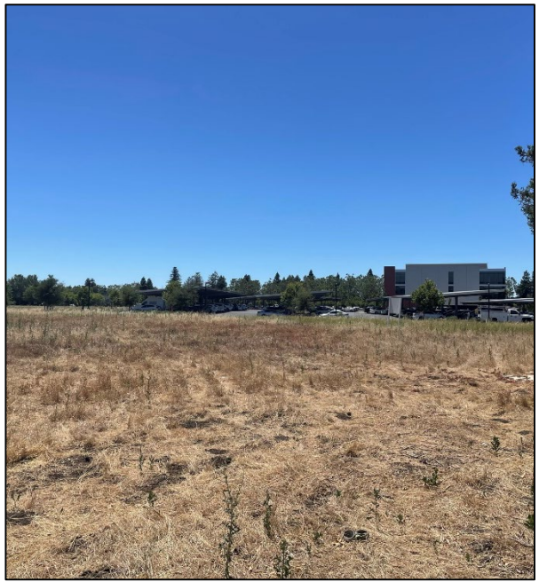
Photograph 1. Non-native ruderal and landscaped land cover type that dominates the entirety of the Study Area, facing west. Photograph taken on June 27, 2022.