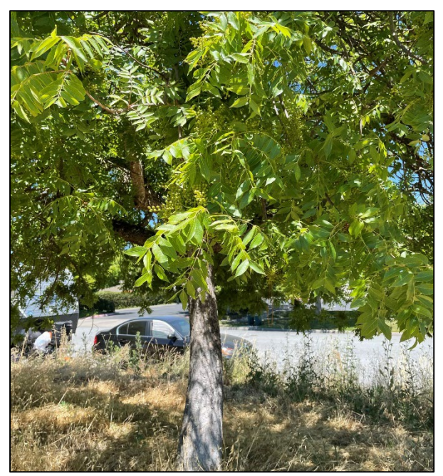
Photograph 6. One of seven planted northern California black walnut, located along the eastern boundary of the Study Area.