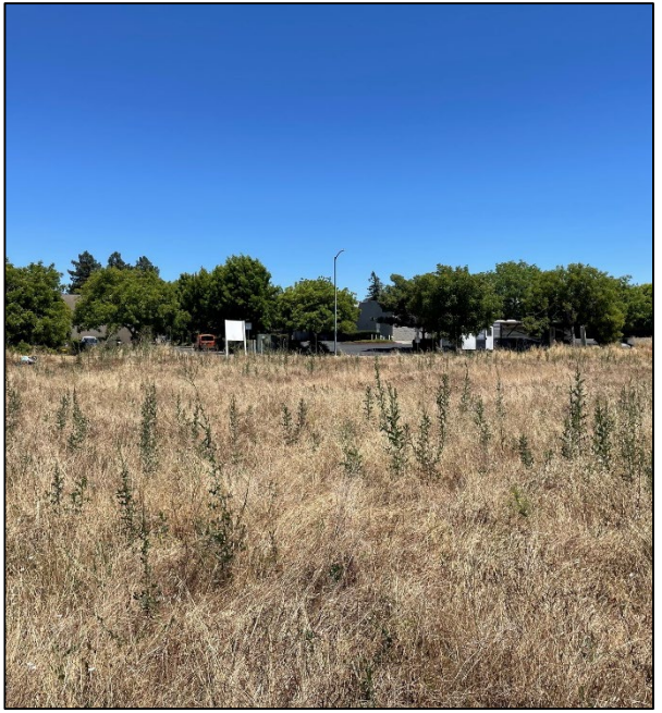
Photograph 3. Non-native ruderal and landscaped landcover type that dominates the entirety of the Study Area, facing east. Photograph taken on June 27, 2022.