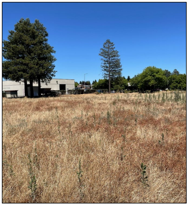
Photograph 4. Non-native ruderal and landscaped landcover type that dominates the entirety of the Study Area, facing north. Photograph taken on June 27, 2022.