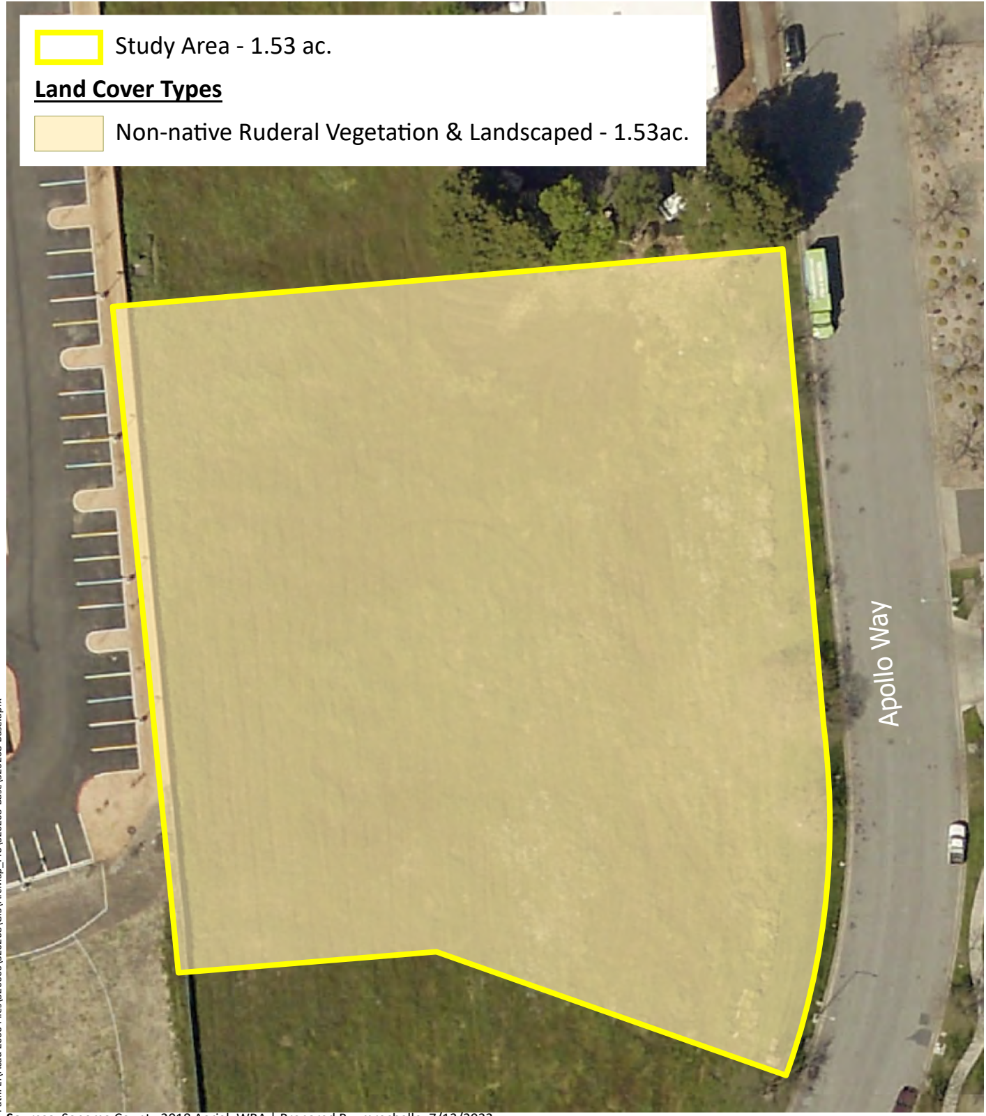
Prepared By: mrochelle, 7/13/2022