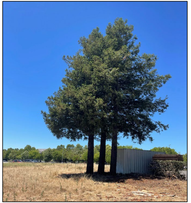
Photograph 5. Three planted coast redwood trees, located on the northeastern corner of the Study Area. Photograph taken on June 27, 2022; facing north.