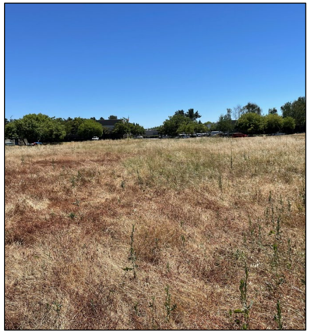
Photograph 2. Non-native ruderal and landscaped landcover type that dominates the entirety of the Study Area, facing south. Photograph taken on June 27, 2022.