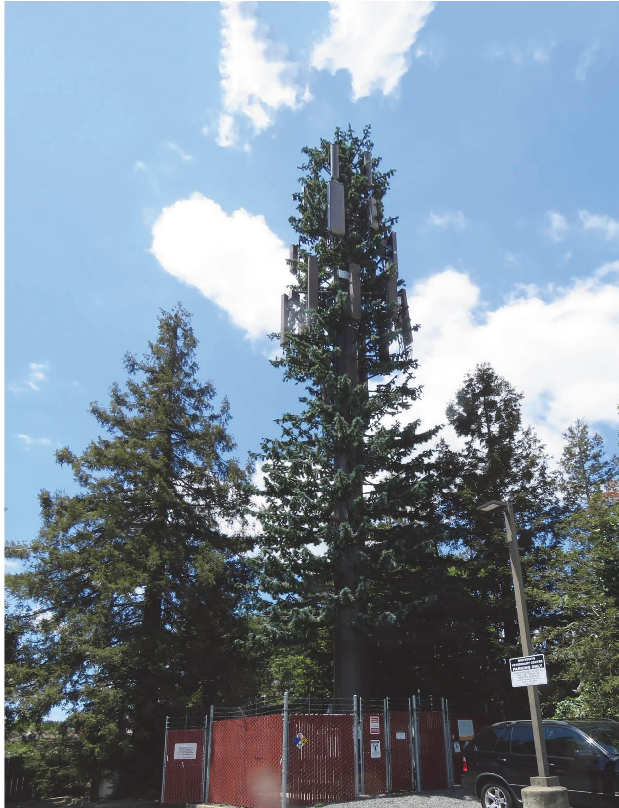
View 02-Before [Looking West]