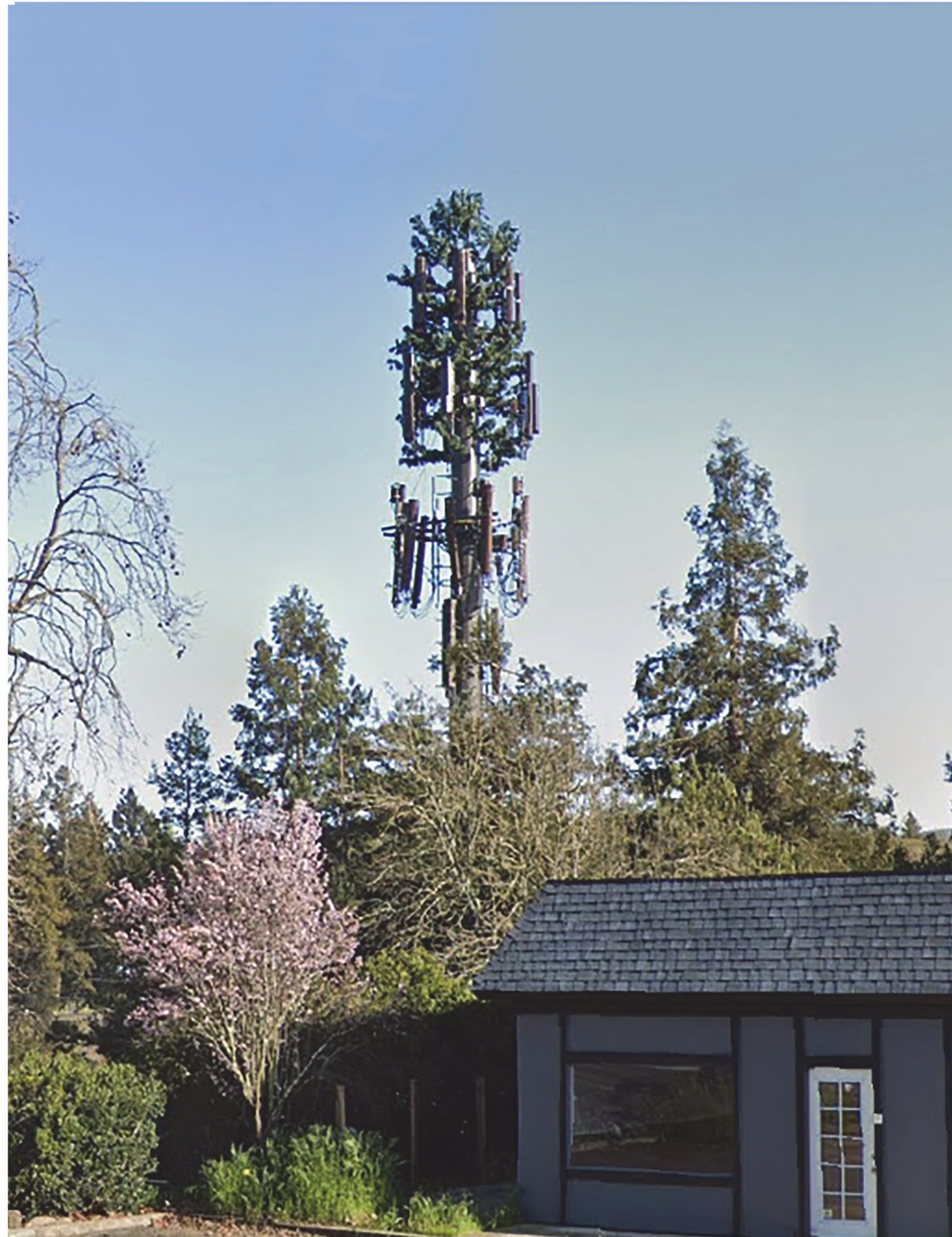
View 01-Before [Looking South-East]