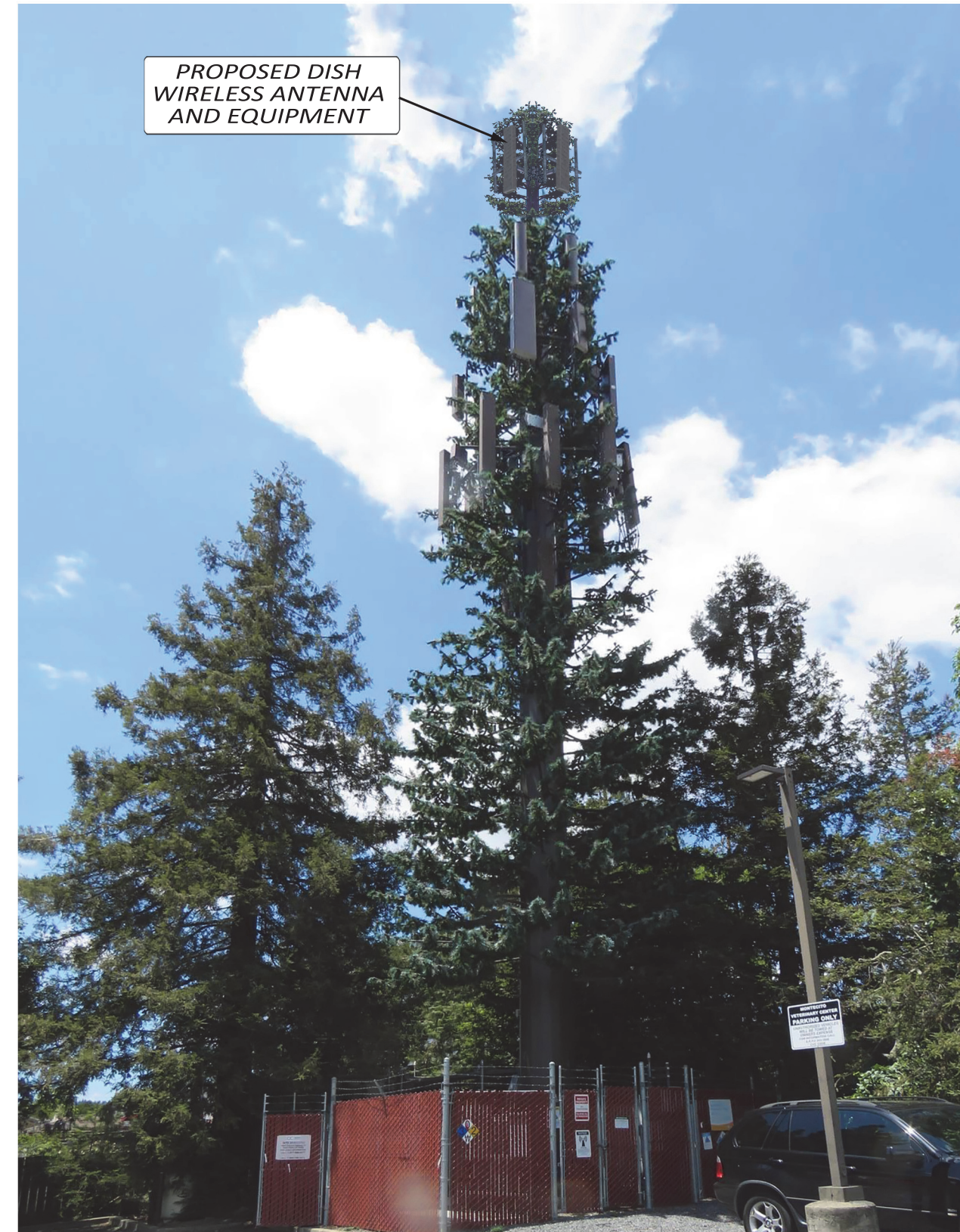
View 02-After [Looking West]

These depictions are for demonstrative purposes only. They are to be used in addition to the engineering drawings for an accurate representation of the site.