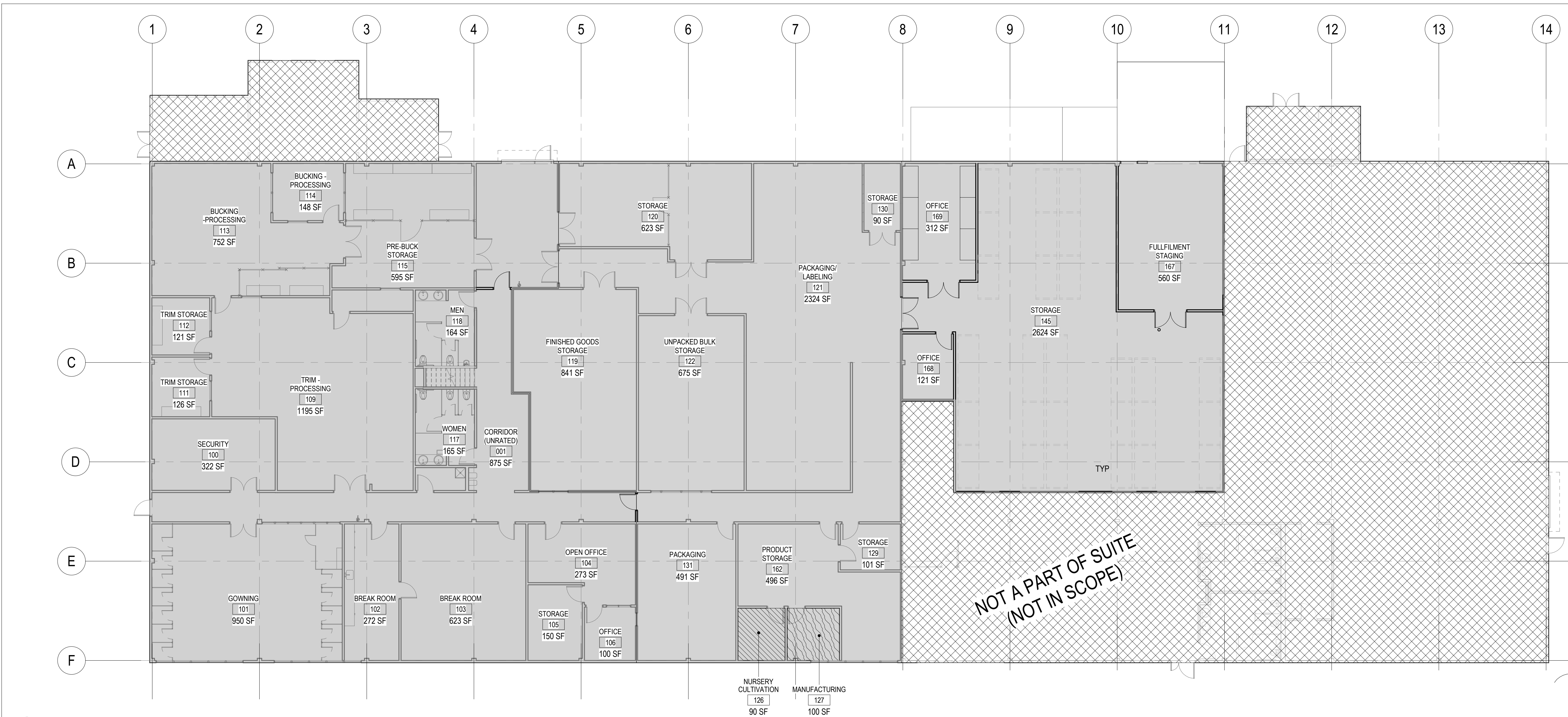
1 OVERALL- FLOOR PLAN. A101 SCALE: 3/32" = 1'-0"